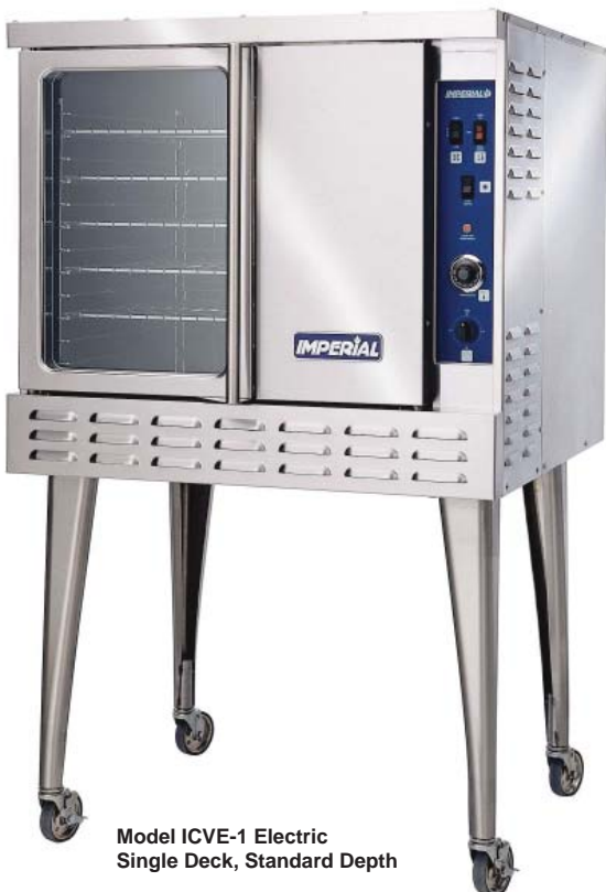
Model ICVE-1 Electric Single Deck, Standard Depth