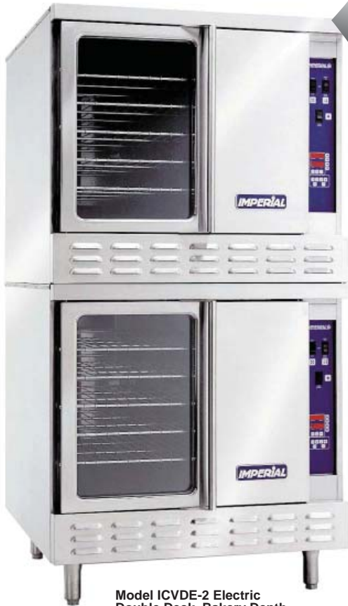
Model ICVDE-2 Electric Double Deck, Bakery Depth