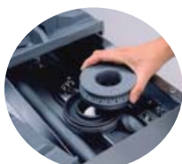
Anti-clogging shield designed in the grate protects the pilot from grease and debris

All measurements in ( ) are metric equivalents.