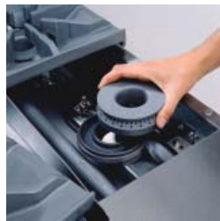
Burner heads remove for easy cleaning