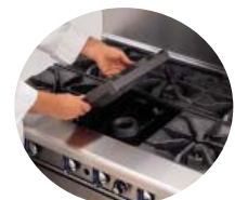
12" x 12" heavy-duty cast grates lift off for easy cleaning