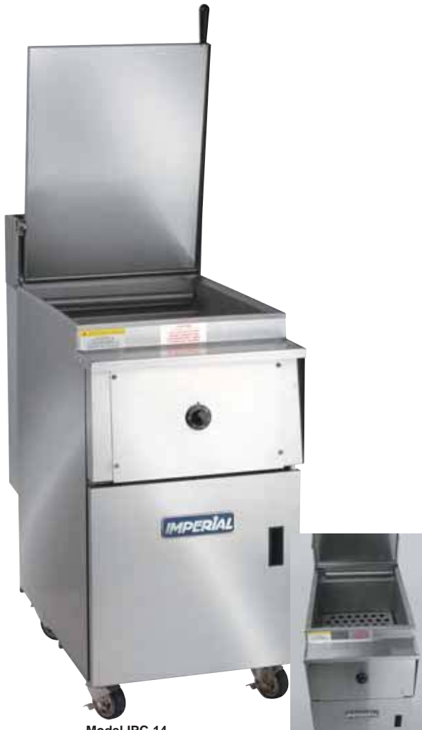
Model IPC-14 shown with optional casters and stainless steel cover

Vessel is 16 gauge 317 alloy stainless steel to withstand stronger concentrations of salt in the water